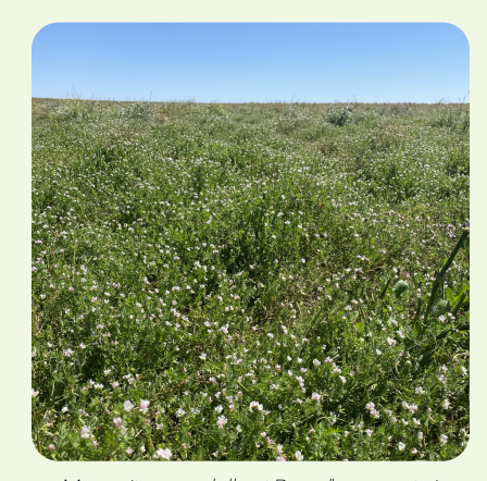
Margarita serradella at Broad's property in November 2021

Number one reason was to improve livestock nutrition in pastures. Previously, annual volunteers (mostly weeds like cape weed, blue lupin, wild radish and ryegrass) were relied upon for pastures. Nutrition in this was low and stocking rates were not as high. By adding serradella into the system, there is also the benefit of extra nitrogen where lupins traditionally did not do very well. Weed management was also a consideration for change as previous pasture rotation only allowed for weed seed bank to increase.