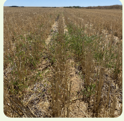
Self regenerated serradella in wheat stubble after harvest 2021. Serradella is adding extra benefit to traditional stubble grazing after harvest