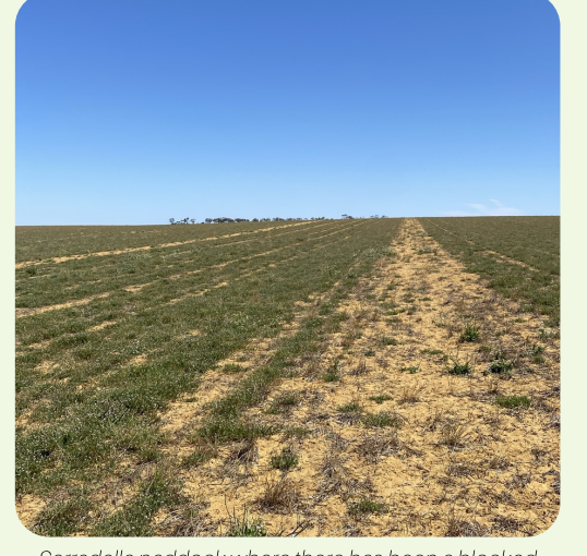
Serradella paddock where there has been a blocked seeding head. The bare area represents what the entire paddock would look like if left to volunteer annual pastures